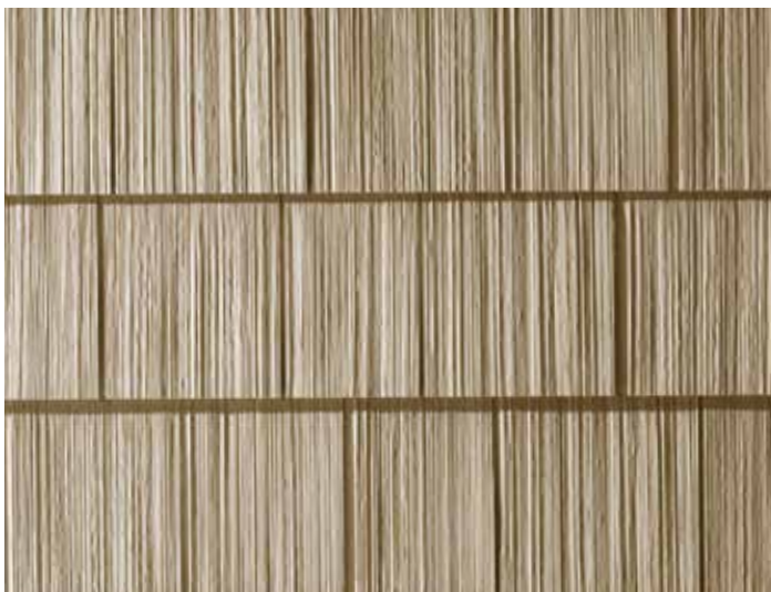
Traditional 7" shake features a remarkably authentic woodgrain texture.

There are no limits to what you can do when you imagine your perfect exterior design. From ornate and dramatic to muted and charming, customization is yours with Pelican Bay One Shakes and Scallops. Beautiful, practical and made to last, this impressive collection features the distinctive beauty of natural-looking woodgrains without the time-consuming maintenance and costly upkeep.