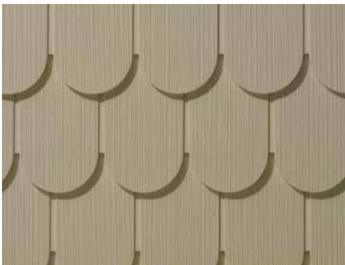
Pelican Bay One Scallops create the distinctive look and roughsawn feel of cedar half-rounds.

Pelican Bay One Shakes are ideal for coastal areas or other high-wind locations. In independent tests, they remained secure in winds equivalent to a Category 5 hurricane.